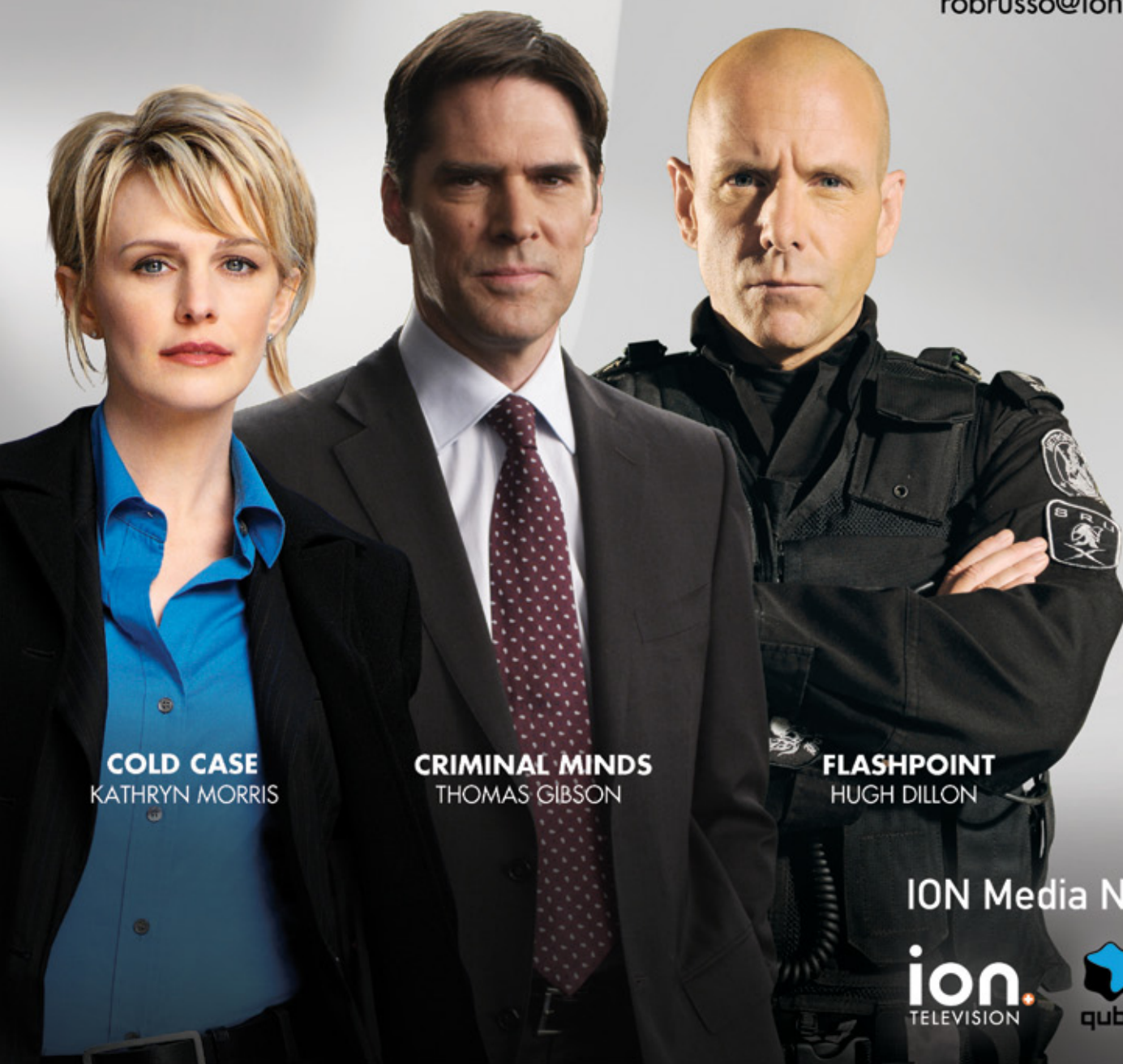
COLD CASE KATHRYN MORRIS